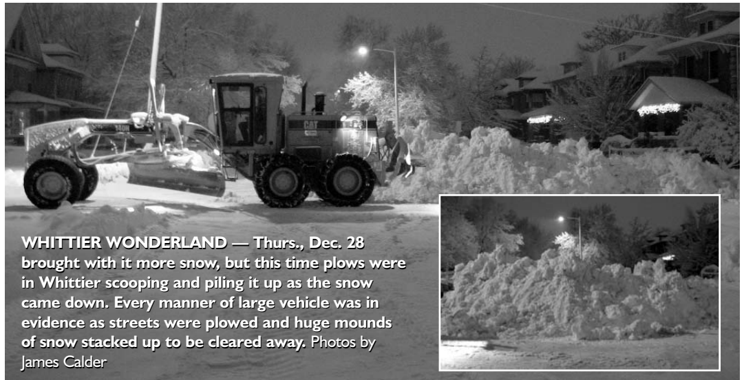
WHITTIER WONDERLAND — Thurs., Dec. 28 brought with it more snow, but this time plows were in Whittier scooping and piling it up as the snow came down. Every manner of large vehicle was in evidence as streets were plowed and huge mounds of snow stacked up to be cleared away.

Note to dog owners: Be sure to clean your dogs' paws after you walk them. The salt used to melt ice can make dogs sick if they lick it off their paws.